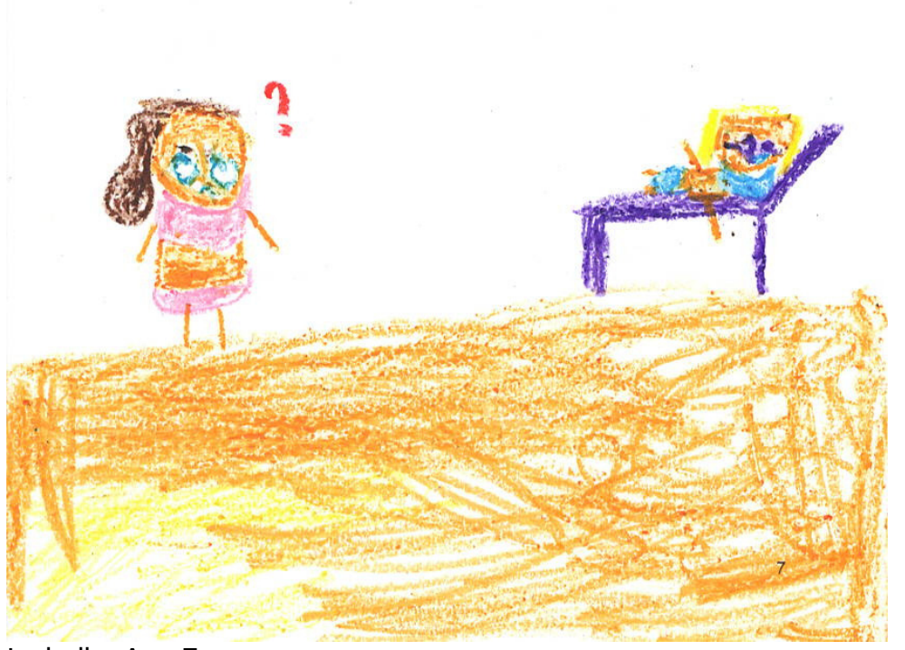
Isabella, Age 7