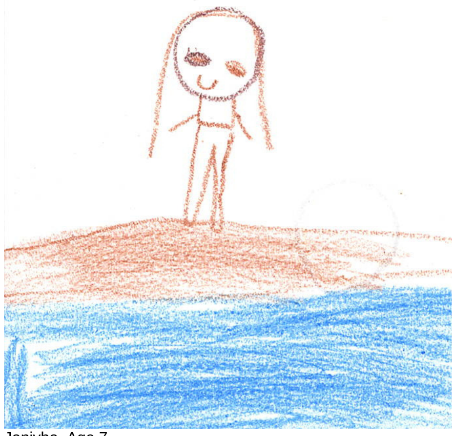
Janiyha, Age 7

keep trash out of it Don't waste it Teach others