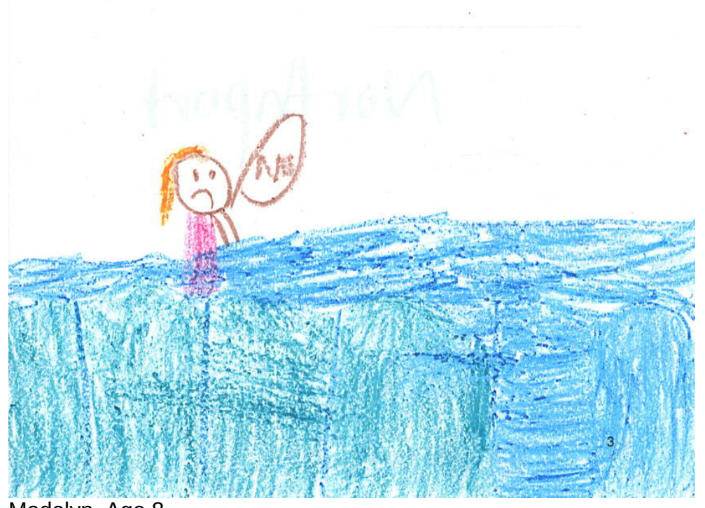
Madelyn, Age 8

It looked like she was trying to catch it.